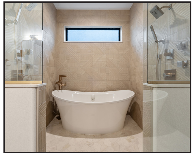
Textured tile and champagne bronze fixtures create a spa like primary bath.